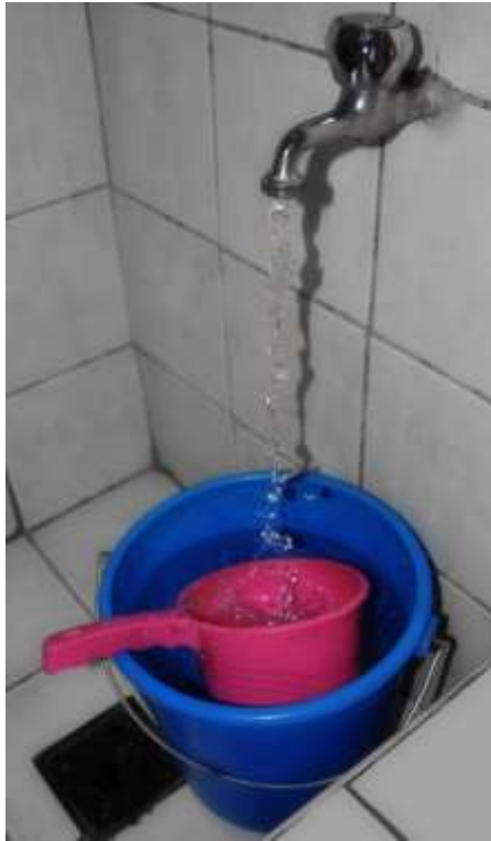
Ladle and Pail